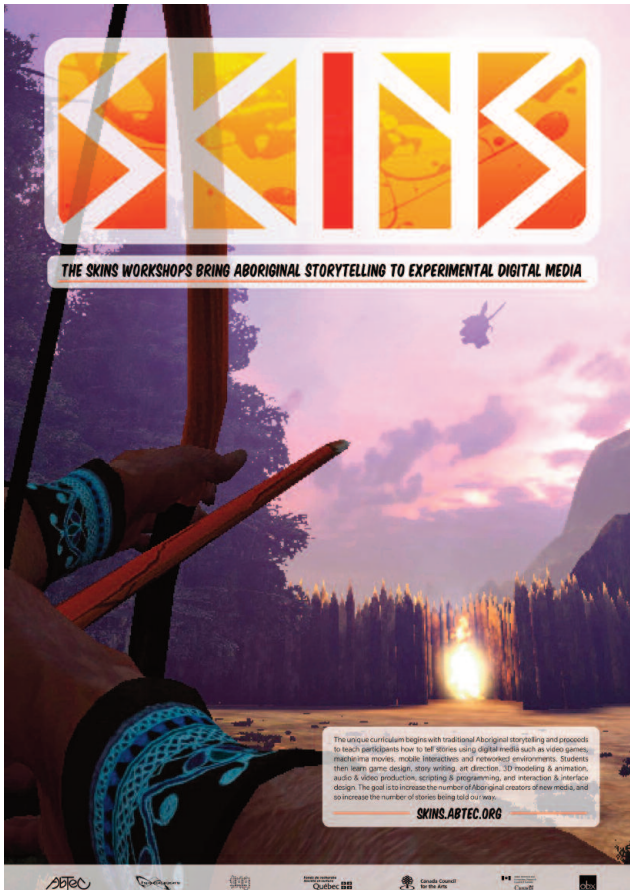
Figure 8: Skins – Skins 1.0 Otsi! Rise of the Kanien'kehaka Legends videogame poster.

Five years into what we see as a multi-decade project, AbTeC is just beginning to understand how digital media technologies and networks can be best used to tell our communities' stories. Whether it be through AbTeC created artwork such as TimeTraveler TM , or through the Skins workshops teaching others the skills to create their own