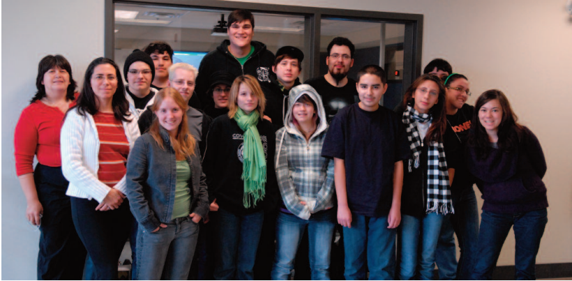
Figure 6: Skins 1.0 – Participants, mentors, and staff

community. The challenge is that Aboriginal communities are embedded in a settler culture that tells many of its stories through technologically-mediated means such as film, television, games, and the Internet. Given the substantial amount of time that contemporary youth spend with these media, many Aboriginal communities worry about how to keep their old stories alive.