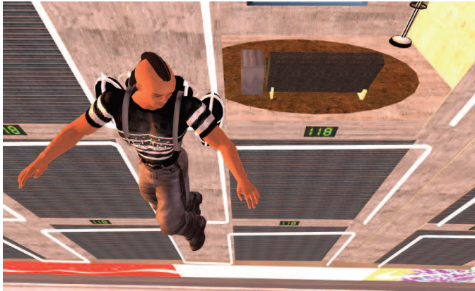
Figure 2: TimeTraveller™ - Jetpack Episode 01 production still, showing the main character Hunter

AbTeC's key research outcomes are creative works. These works serve as boundary objects that are much more effective as arguments than analysis and writing alone, particularly to our core audience of Aboriginal youth, artists, educators and cultural workers and their communities. We address the academic community in our dissemination, and hope to have an impact on ongoing conversations about Aboriginal cultural policy, educational approaches, and research methodologies. Yet screening episodes of the TimeTraveller™ machinima series to elders is far better at generating a conversation about our questions than presenting a paper to them; playing a video game, designed by a team of Aboriginal youth in our Skins workshops, is far better at engaging youth in issues than asking them to read a journal article. Even within academic and policy circles we find that the creative works themselves strongly reinforce the necessity of maintaining a broader, culturally-grounded underpinning to the (often abstractly narrow) intellectual focus of those conversations.