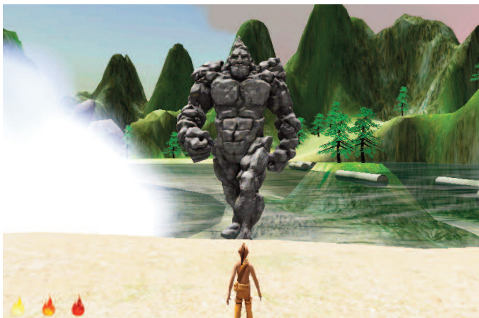
Figure 7: Skins 2.0 – Skahion:ati: Approaches the Stone Giant, from The adventure of Skahion:ati: Legend of the Stone Giant

Yet, in both Skins workshops, participants were able to contribute personal experiences with these stories, indicating that the tales are percolating down the generations through many avenues (see Figures 6, 7, and 8). Some of the participants traced their knowledge to family members, some to books from the cultural centre's library, and some to classes taken in the reserve's school system. At the same time, though,