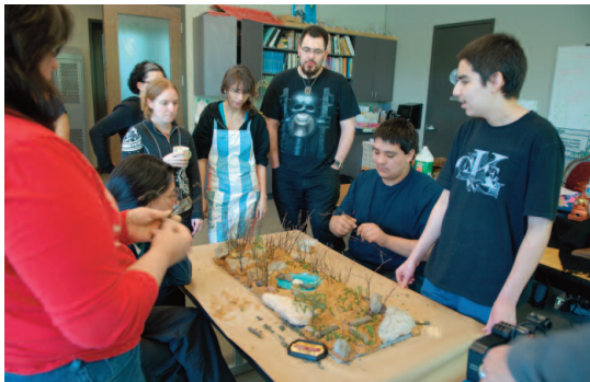
Figure 5: Skins 1.0 - Clay model of the Otsi! Rise of the Kanien'keha:ka Legends video game level

Our preliminary evidence is positive. Aboriginal youth, just like their peers in the wider society, are highly engaged with videogames. Many are interested in creating their own games, and the videogame workshops enable that learning within a context of community storytelling. Our communities are rich with stories full of amazing characters,